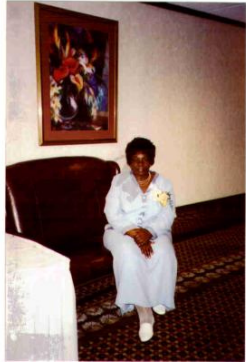
Mom in Boston