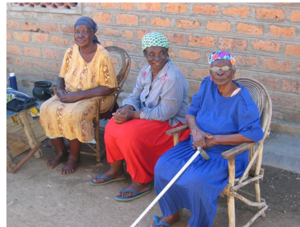
Mom and Grannys