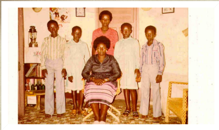
Mom and Kids